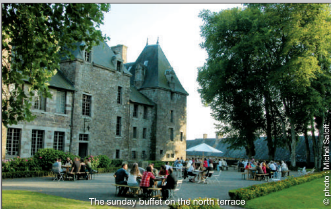
The sunday buffet on the north terrace