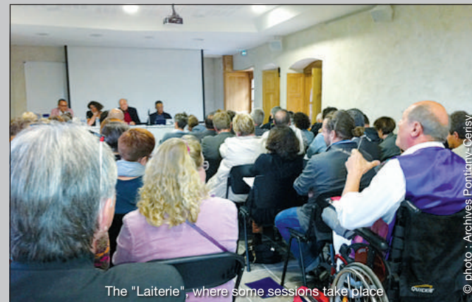
The "Laiterie", where some sessions take place

- With the conferences still typically from one week to ten days, like the original meetings in Pontigny, the Centre offers conference guests a rare opportunity to have extended discussion in a warm environment conducive to building lasting friendships and blazing new trails.oute indépendance, de "penser avec ensemble".