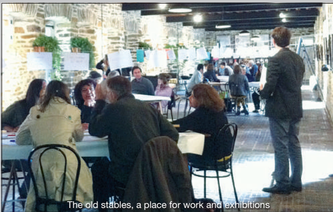
The old stables, a place for work and exhibitions