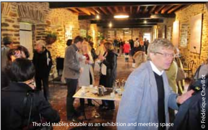
The old stables double as an exhibition and meeting space