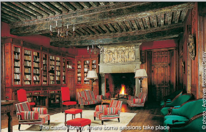
The castle library, where some sessions take place

The site is classified as a historic monument (Monument historique) «because of its architectural quality and its overall great consistency as the centre of culture and history, as well as that of modern thought».